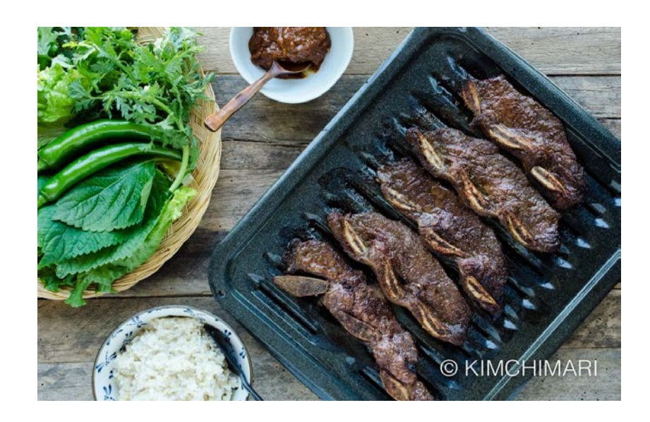
Serves 4-5 Prep: 20 min Rest: 30 min~ 8 hrs Cook: 25 mins